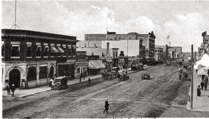
Second Ave., looking North, Saskatoon, Sask.